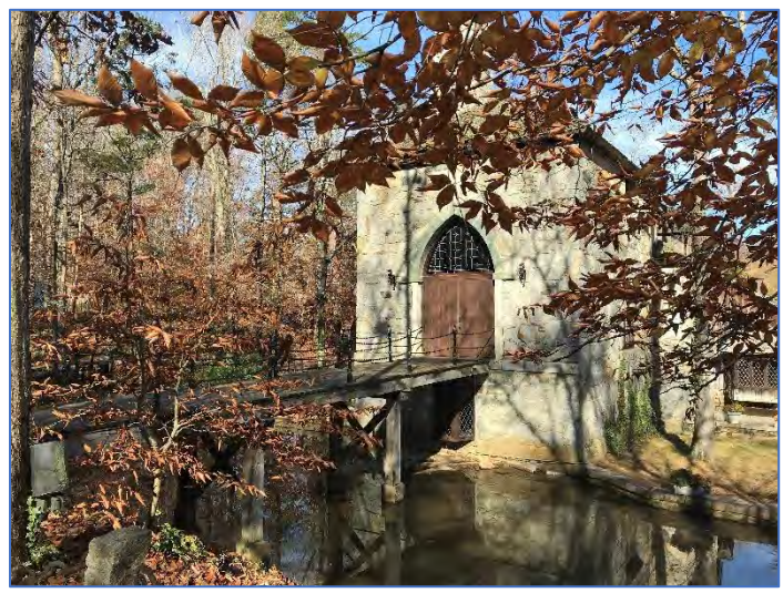
Castle McCullough is particularly beautiful in autumn, and it was a perfect day for the event.

Jamestown – On Wednesday, November 16, 2022, ten new Sir Knights, representing the Salisbury, Monroe, Ivanhoe, and Nazareth Commanderies, were created in the conferral of the Order of the Temple at the beautiful grounds of Castle McCullough.