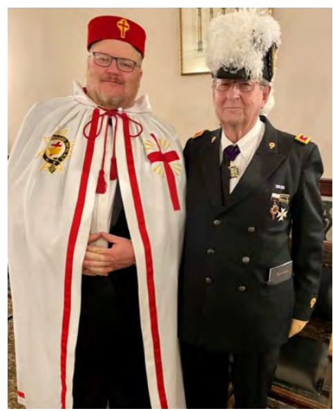
Sir Knights on Duty