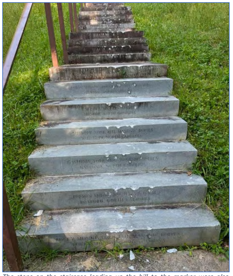
The steps on the staircase leading up the hill to the marker were also damaged. The repairs to the marker and surrounding structures will be very expensive and will take months to complete.

Blue Ridge Parkway – The Masonic Marker that has for decades stood peacefully in a small park off the Heintooga Road section of the Blue Ridge Parkway was severely damaged recently by lawless vandals. One or more criminals took hammers and broke pieces off of the steps leading up to the marker, then forced the steel gates open and damaged many of the stones on the marker itself.