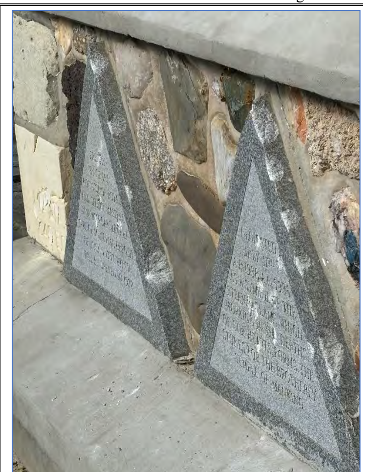
Damage was done to the stones on the marker inside the steel fence, which was forced open. Some of these stones are irreplaceable.

Law enforcement rangers from the National Park Service have been onsite to collect evidence and have open an investigation. This is just the latest incident of vandalism targeting lodges and churches throughout the area, and comes on the heels of the damage suffered by the Charlotte temple in March.